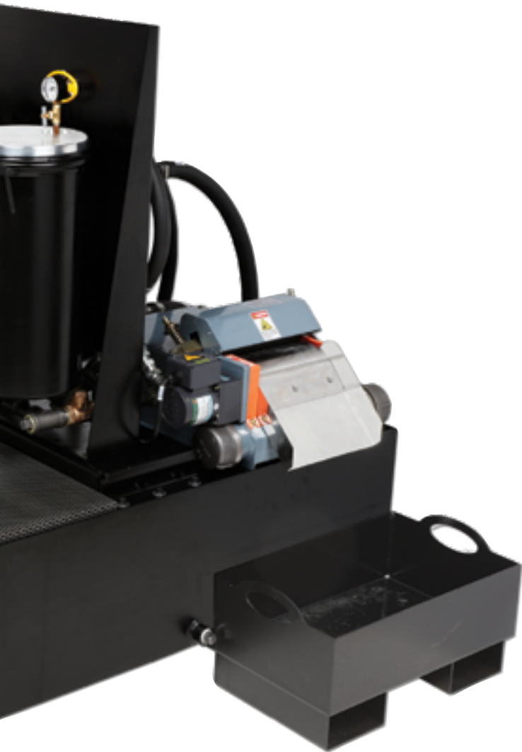
416-liter (110-gallon) Grit Guard Coolant pictured. 208-liter (55-gallon) unit is pictured on the front.